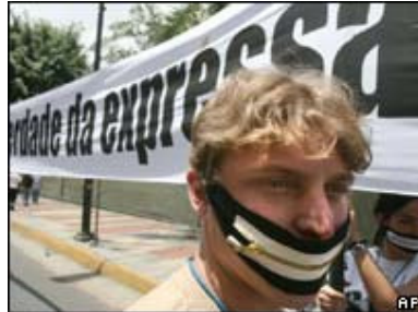
Protests for and against the end of RCTV's licence are likely all week

Staff and supporters of a Venezuelan TV station that is due to be taken off air have unveiled a kilometre-long banner in Caracas in support of press freedom.