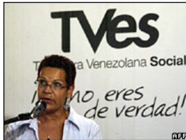
The new state-sponsored station will perform a social role, its board says

Its frequency is set to be taken over by a new government-funded channel called TVES or Televisora Venezolana Social.