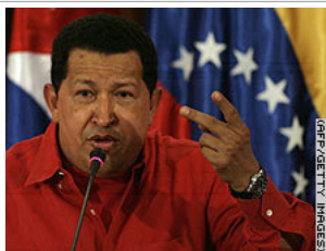
RCTV and Venezuela's opposition argue that President Hugo Chavez is trying to silence criticism by not renewing the station's license.