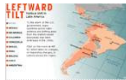
Leftward tilt Political shift in Latin America

Although newspapers continue to slam Chavez, employees say they have gradually softened their editorial lines to maintain good graces with the government as it unleashes a flood of advertising dollars.