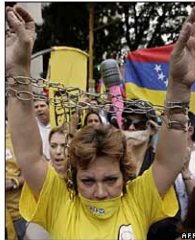
Some see the RCTV closure as an attack on freedom of speech

Mr Chavez has said private stations such as RCTV were involved in a coup that nearly toppled him five years ago